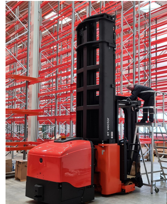
Expansion and increased automation of the warehouse in Weimar (GE).